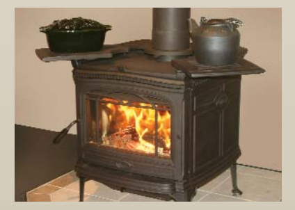
Concealed swing-out Cook Top means warm meals in wild winter weather.